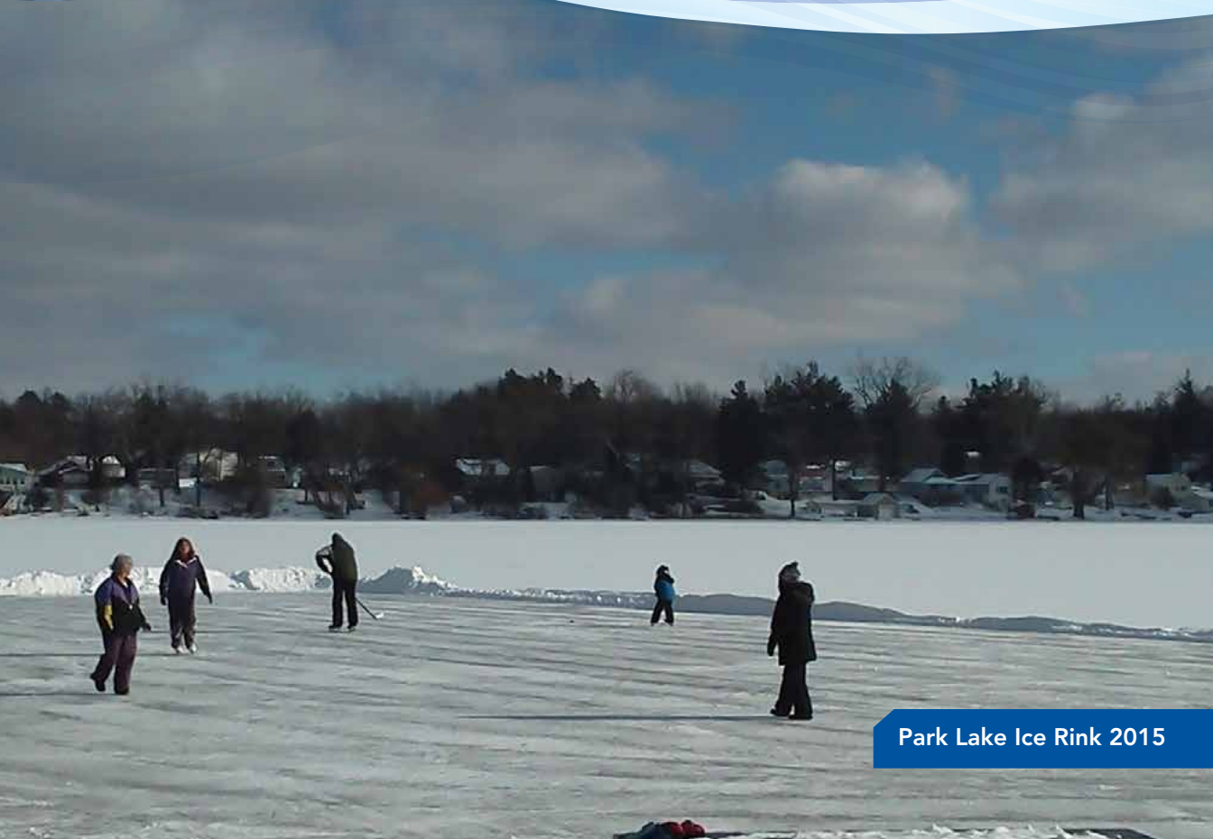
Park Lake Ice Rink 2015