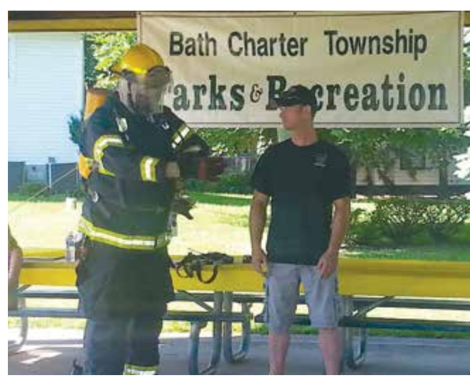
Summer Activities in the Park, Bath Volunteer Fire Fighters

Program offered to 1st – 3rd graders. December practices, then one game per week during January and February (weeknights only). Program will provide instruction, recreation and development of individual skills, with an emphasis on team play and group cooperation. Parents: Coaches are needed – Please consider becoming a volunteer. More details to come on the P&R website as they become available.