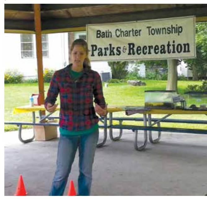
Summer Activities in the Park, Woldumar Nature Center

This annual competition runs from December 1, 2014 – February 28, 2015. Build a snow/ ice sculpture; register your masterpiece at the Township Offices for a chance to win a Meijer gift card. Entries will be judged using "winter wonderland" as the theme. The 2014-15 event is sponsored by a friend of Parks & Recreation, offering two $25 Meijer gift cards (to 1st & 2nd place winners).